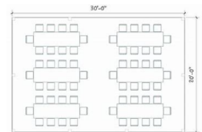
TEMPORARY MEMBRANE STRUCTURES AND TENTS