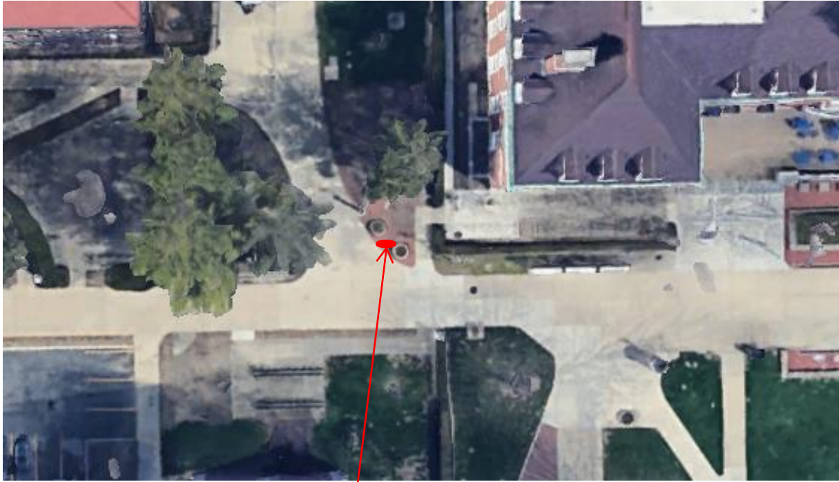
Sign 6: 'Sidewalk closed ahead. Access Illini Union west entrance only. ADA accessible