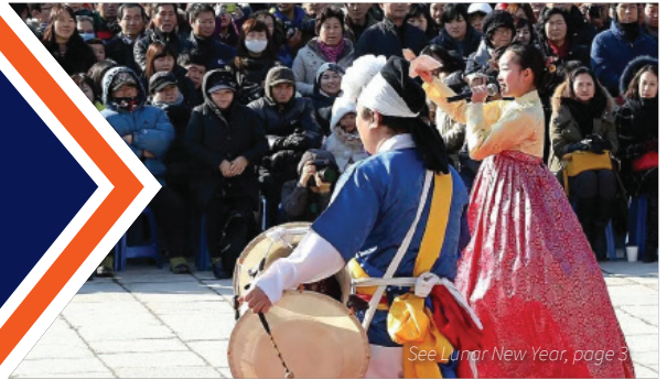
See Lunar New Year, page 3